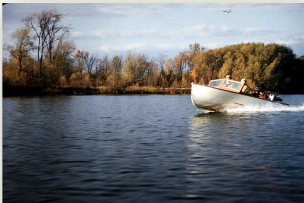
Bradley boat on the Mississippi River, 1960s.