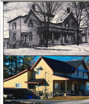
55 Lake Avenue East