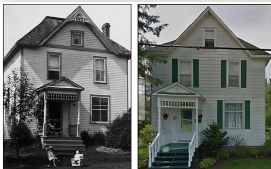
20 Caldwell Street

If you have an older photo of your Carleton Place (or Beckwith!) home, send it along and we'll include it.