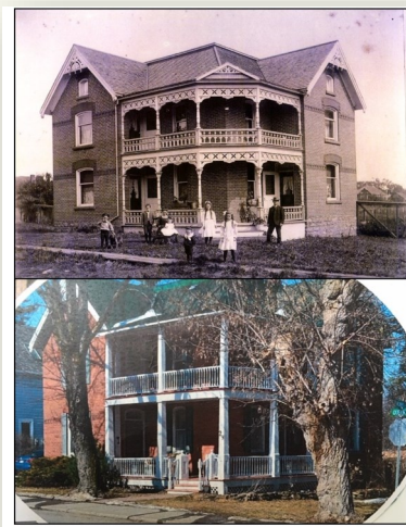
29 Queen Street