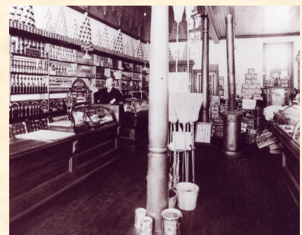
Edwards Grocery Store, Franktown Rd

The museum will open for the season on Saturday May 19, 2012 at 10 am . Our feature exhibit this summer is entitled " A Pinch of This, A Dash of That... ". Exhibits will explore the history of gathering and producing food, food preparation at home, home economics studies in school, and even touch on the use of table manners! Carleton Place has a long history of successful restaurants, food distributors and grocery stores. Artifacts and photos from many will be on display.