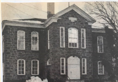
The Victoria Street School, should provide Carleton with a fine site for a museum. Originally scheduled to open in 1984, the museum opening was pushed ahead to 1985 because of funding problems. The museum committee recently approached Carleton Place Town Council for $20,000 to fund the museum.