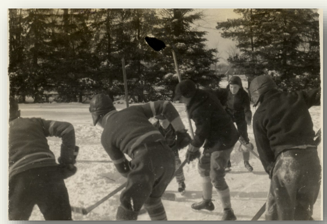
A game of shinny on High Street, 1940

Many times we would play shinny with crooked sticks and horse dung across Bridge Street. We used to play hockey behind Frank Lancaster's and also in Happy Valley (Lanark Street). We would use second hand hockey sticks and for shin pads we used old magazines and Eaton's catalogue split in two for goalie pads.