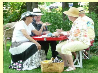
Enjoying a picnic lunch at last year's event!

Travel back in time for an afternoon at the CP & B Heritage Museum as we Picnic Like it's 1916! Our third annual Family Picnic will take place on Saturday, July 16 th from 1 - 4pm. Admission is only $2 per person and includes entry to the Museum. Pack a lunch, bring a blanket and find a shady spot in the Victoria School Garden to enjoy lunch. Sweet treats and beverages will be available at a small cost. Enjoy live music, children's activities, historical displays and even visitors from the past!